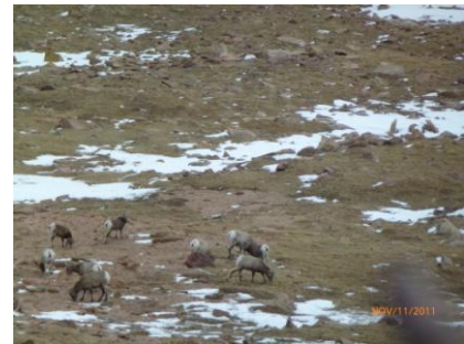
Whose session did they attend?