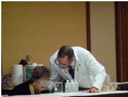
Can you see it?