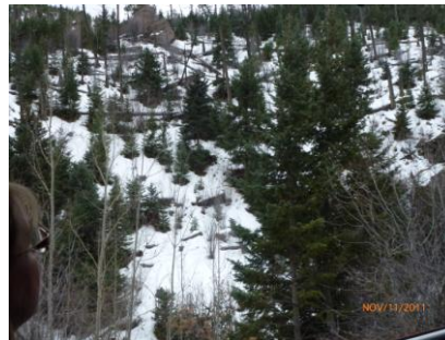
There was snow!