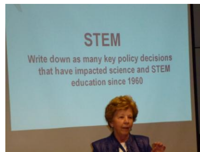
Yes! We are STEM